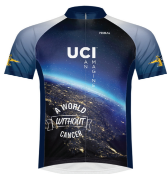
2020 Team Jersey

Many on our UCI Retirees & Friends team have or have had personal struggles with cancer. Please consider making a donation, joining our team, and telling everyone you know to join our efforts. ALL revenue from this (virtual) event will go directly to support cancer research at the UCI Chao Comprehensive Cancer Center.