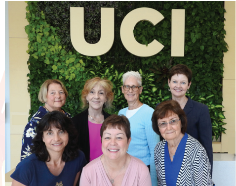
UCI Retirees Association Board

Your responses will be anonymous. The data will be used to create a report for key administrators in the President's Office and at each campus and laboratory. The 2016 report is an excellent example: http://cucra.ucsd.edu/survey/