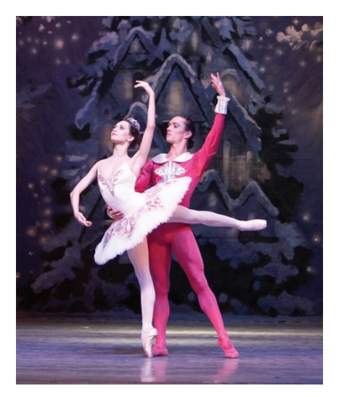
Russian State Ballet. 2010